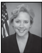
Senator Mary Landrieu (D)