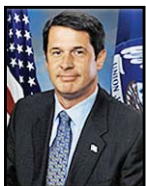
Senator David Vitter (R)