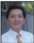
Representative Anh "Joseph" Cao (R) District 2