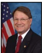
Representative Charles Melancon (D) District 3