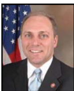
Representative Steve Scalise (R) District 1