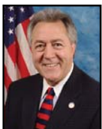
Representative Rodney Alexander (R) District 5 Monroe office: (318) 322-3500 Washington, D.C. office: (202) 225-5639 http://www.house.gov/alexander/